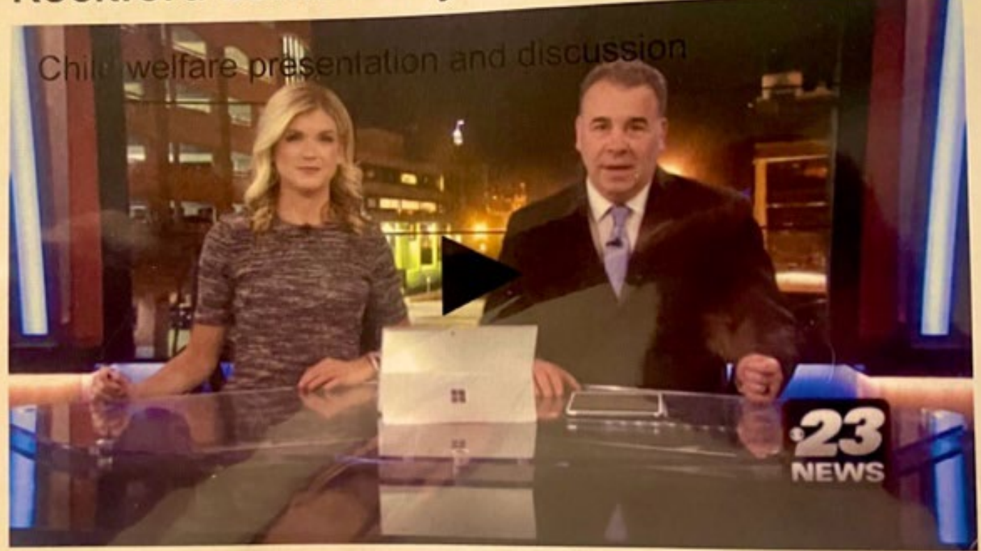
By WIFR News Room | Posted: Tue 9:56 PM, Apr 09, 2019 | Updated: Tue 10:44 PM, Apr 09, 2019

Rockford, III (WIFR) -- In Illinois, Twice as many African American babies die compared to the number of White babies that die during the first three years of life. But the Winnebago County Permanency Action Team is fighting those statistics in an effort to improve the lives of stateline children.